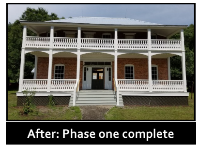
After: Phase one complete

10/22/2022 BARBERVILLE PIONEER SETTLEMENT