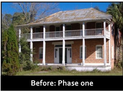
Before: Phase one