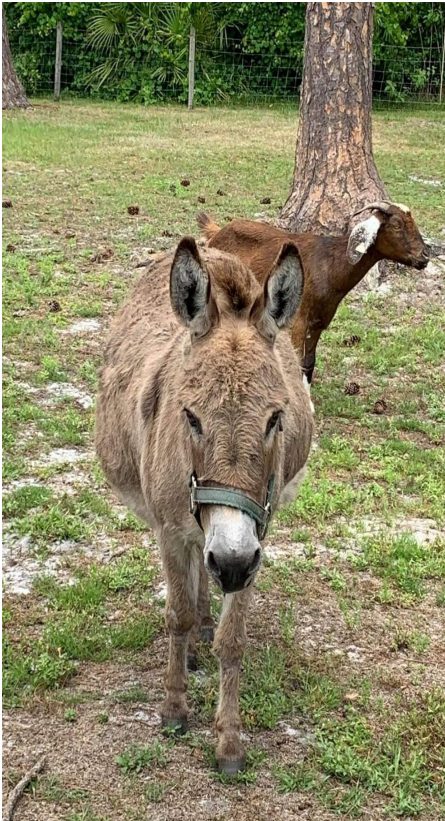
Sponsor Tamale the Donkey, Ollie the Goat , or any of our many many other loving fur-friends!

After September 4 th , our next big event is the 45 th annual Fall Country Jamboree! This the largest event we do every year. This year it’ll fall on the weekend of November 6 th and 7 th . We’ll have hundreds of musicians, arts and craft vendors, food, historical demonstrators, storytellers, and much more!