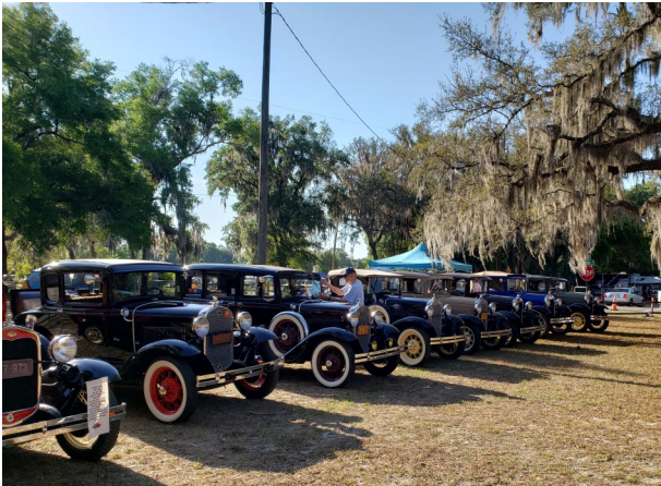
Crank’n A’s Car Show at the Spring Frolic

So, as you can see, while 2020 affected us all, we’re hopeful and excited for this trend toward normality. We do implore you, if you are in a position where you can donate money or volunteer time, we really could use your help to right the ship. Thank you!